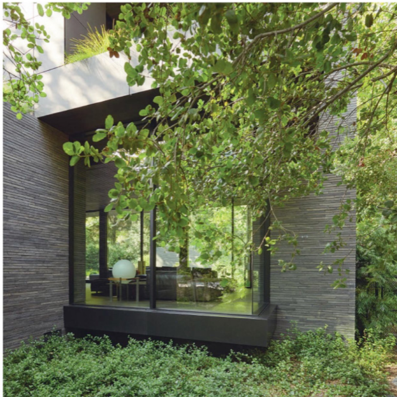
Living room Floor-to-ceiling windows invite views of the garden inside, while the relaxed feel of the indoors extends onto the terrace, where there's another 'Extrasoft' sofa by Piero Lissoni for Living Divani. The lamp is a vintage brass design by Kari Ruokonen for Finnish brand Orno Stockist details on p215 ►