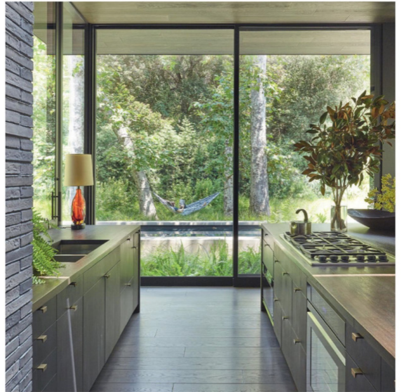
Kitchen A double-height ceiling with a lightwell adds a dramatic feeling of space to this end of the house. The island and stools were designed by Marmol Radziner and the table lamps with Murano glass bases are vintage pieces by Flavio Poli for Seguso Stockist details on p215 ►