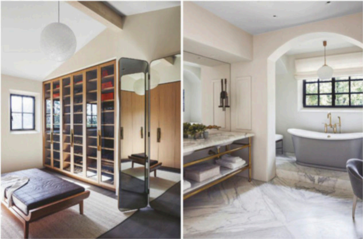
DRESSING ROOM A bespoke glass-fronted wardrobe ensures there is a place for everything. Bench , Therien & Co. Rug , Holland & Sherry